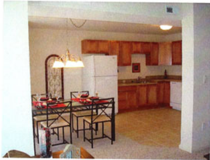
OPEN FLOOR PLANS!